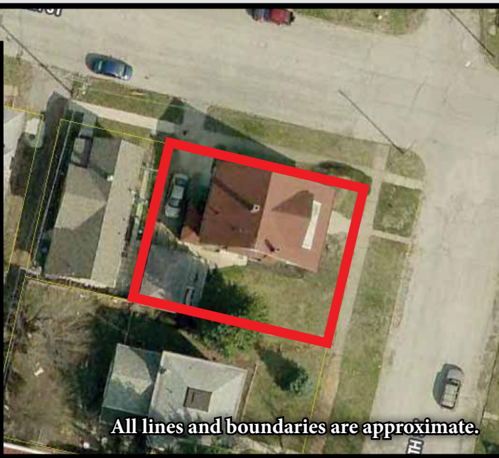
All lines and boundaries are approximate.